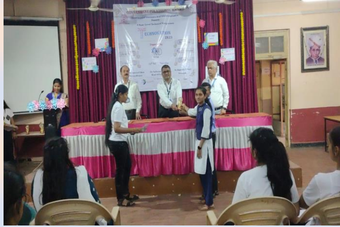
Winner in the state level event Circuit Fixer TECHNOVATION 2023 Prize Distribution