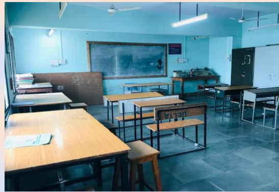
Transducer and Measurement lab