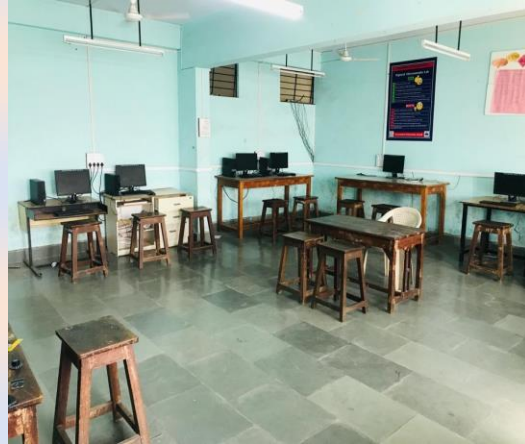
Digital and microcontroller lab