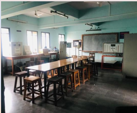
Biomedical and instrument lab